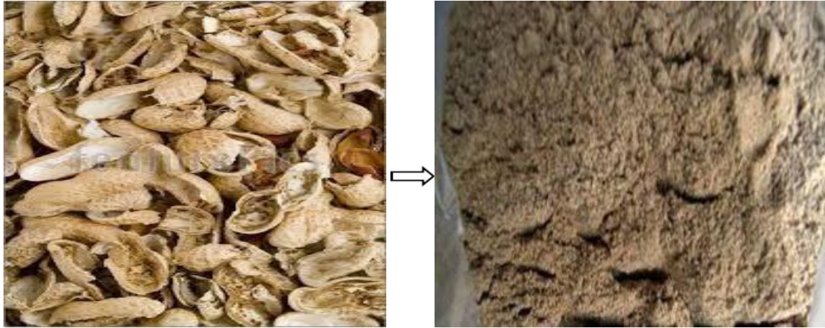
Fig. 1.2 Groundnut shell Ash

the construction industry. The groundnut shell is used in the powder form as the replacement of fine aggregates. Groundnut shell is used for making roof sheet materials. For developing sandcrete blocks [7] and also as cement replacement [8] and as fine aggregate replacement [9], [10] and [6]).