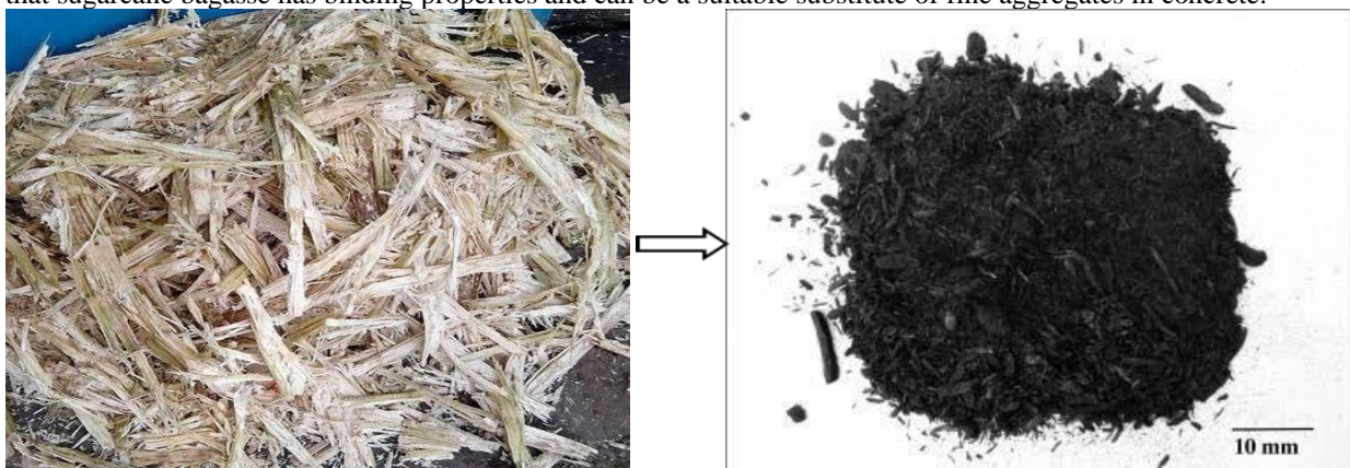
Fig. 1.1 Sugarcane Bagasse Ash

After crushing and extraction of Juice from sugarcane, the fibrous residue left over is known as ‘bagasse’. These bagasses are burnt and are converted into bagasse ash which is then used as fine aggregate replacement in concrete to minimize the use of natural aggregates. The bagasse samples to determine the crystalline characteristics by X – ray diffractometry and particle morphology by SEM analysis. In X-ray diffractometry test results, Quartz appeared as the principle element of sugarcane bagasse ash. SEM analysis revealed that samples of sugarcane bagasse ash were made up of grains with varied shapes and sizes up to 150µm [5]. Authors suggested that these findings reveal that sugarcane bagasse has binding properties and can be a suitable substitute of fine aggregates in concrete.