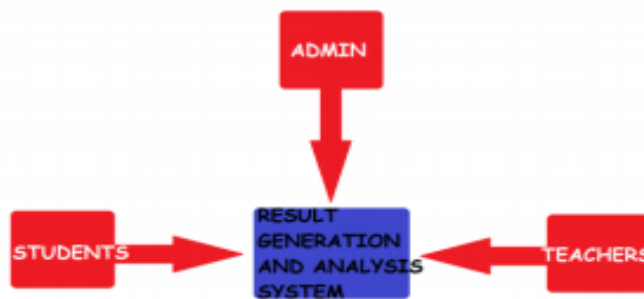
Fig. 3.1 Block Diagram of System