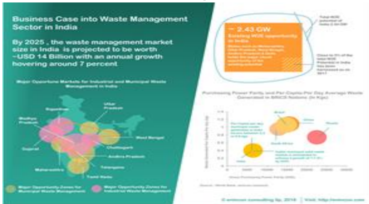
Fig. 2.2 Business Case into Waste Management in India