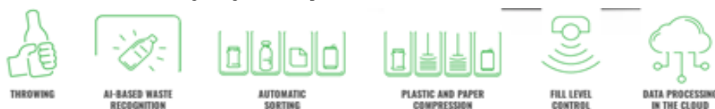
Fig. 8.1 Working Scheme