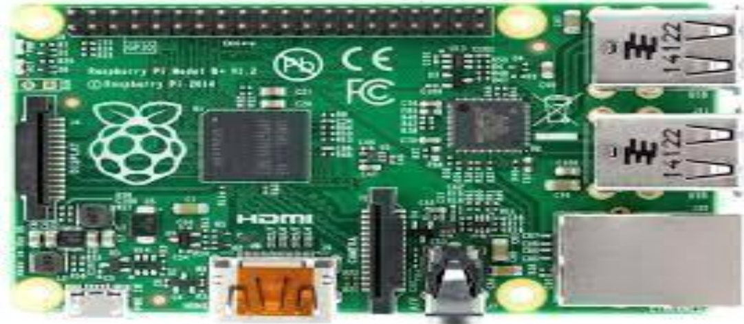
Fig. 3.1 Raspberry Pi b+ Model

This is important in computer area and any computer, you use is connected to a many device that we use.