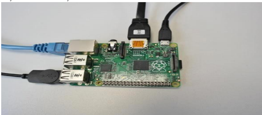
Fig. 3.2 Interfacing Device

The 'ds18b20' it is a temperture sensor be a one wire digital sensor. This goes with a totally close package that help us to gather temperatures in wet surrounding with easily one wire interface. this basically tell that it is may combine the so many devices.