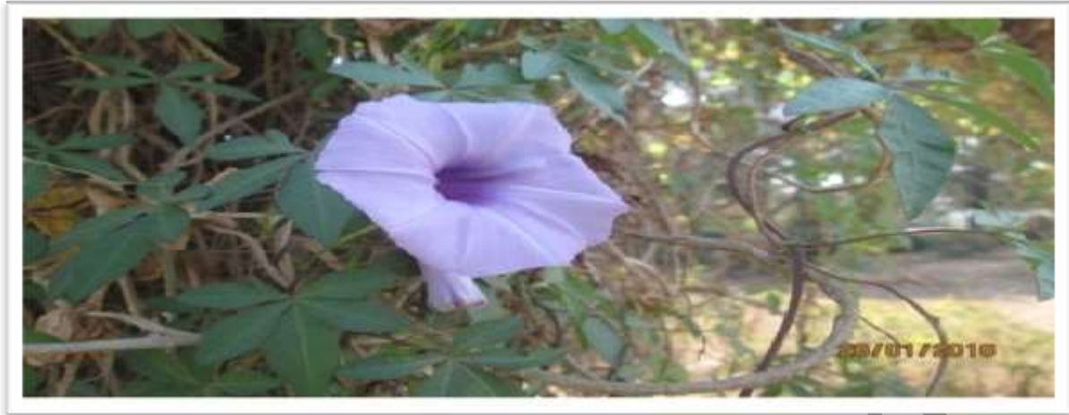
Fig. 2.1 (C) Images Ipomoea aquatic: Flower