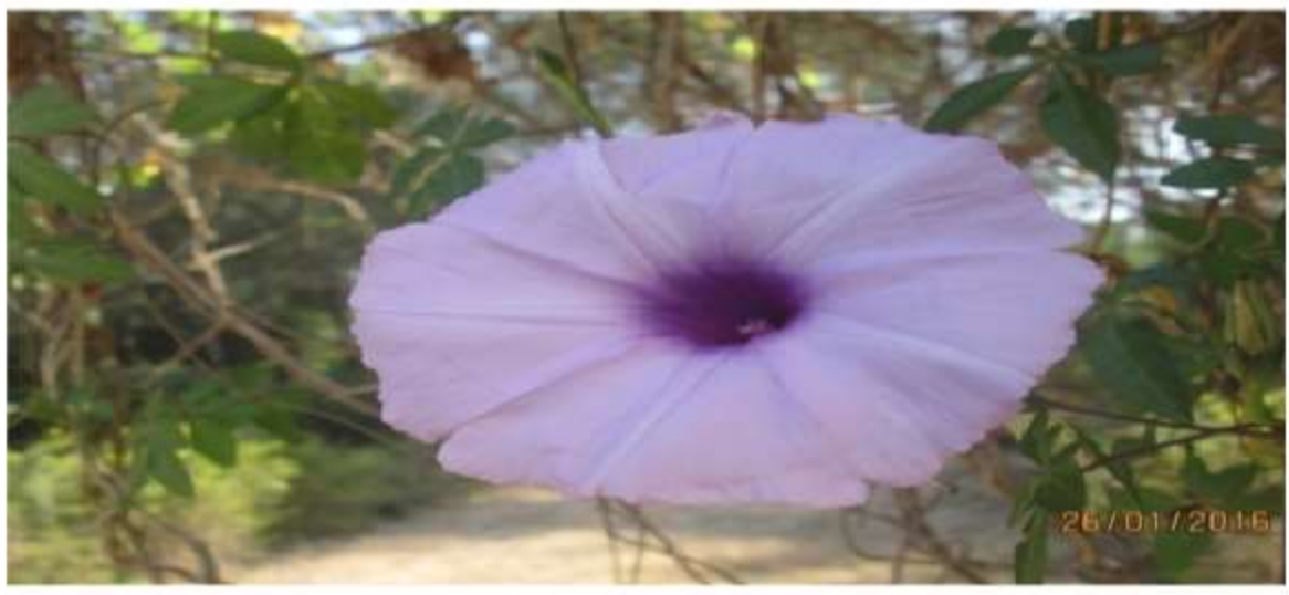
Fig. 2.1 (B) Images Ipomoea aquatic : Flower