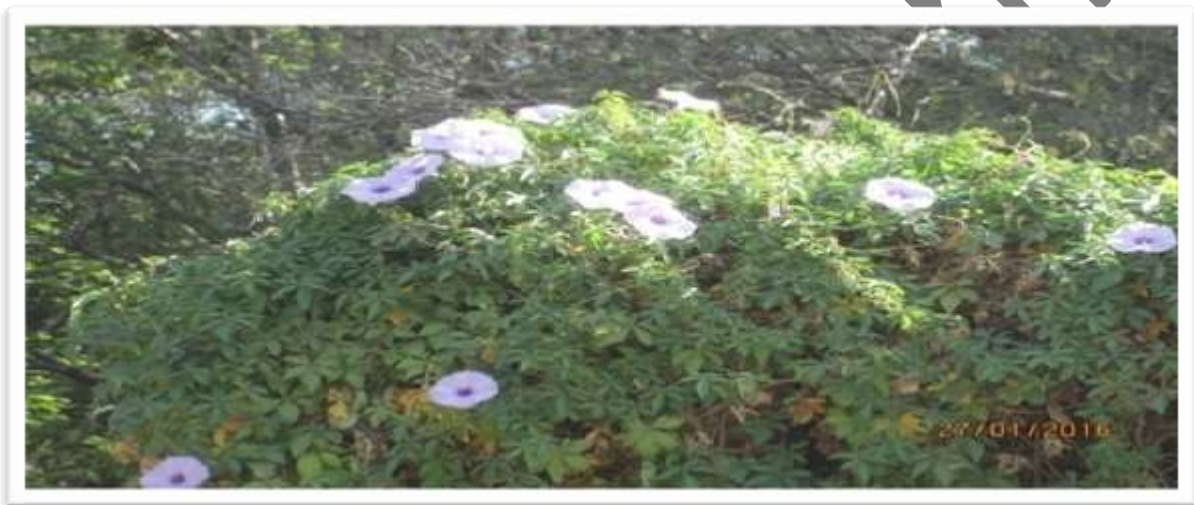
Fig. 2.2 (D) Images Ipomoea aquatic: Habit