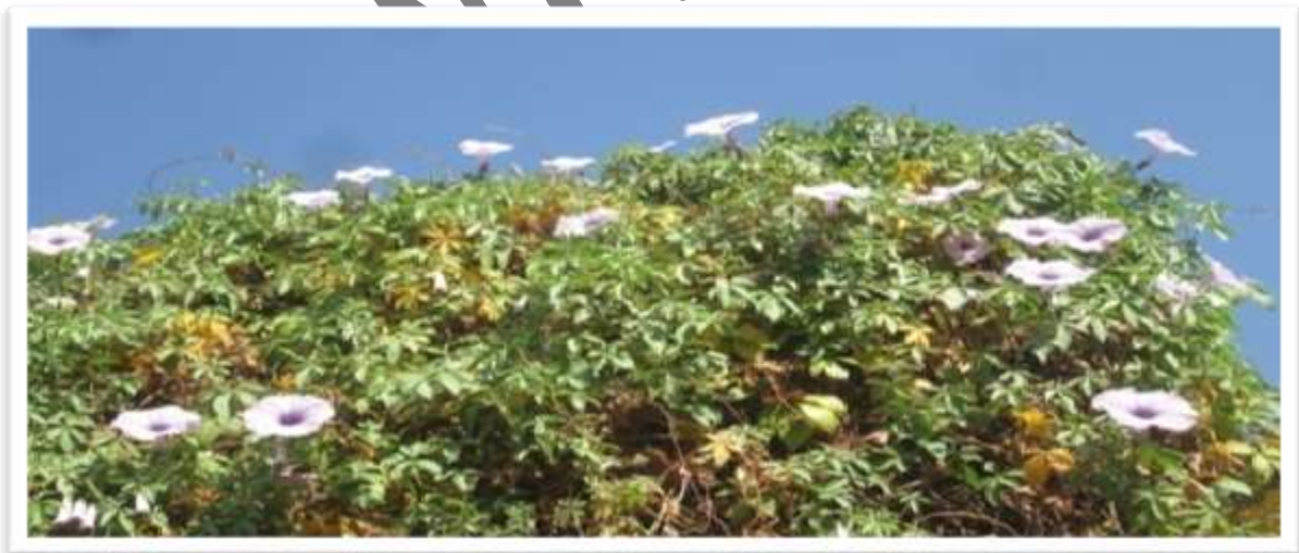
Fig. 2.2 (E) Images Ipomoea aquatic: Habit