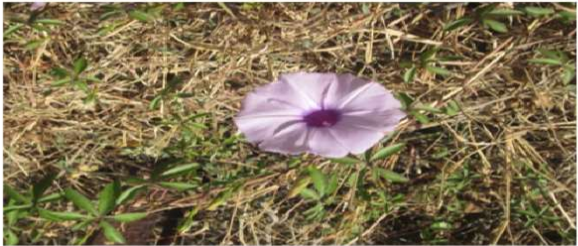
Fig. 2.1 (A) Images Ipomoea aquatic : Flower